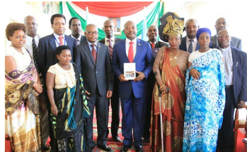
President Nkurunziza receives the CNDI report (May 2017).

Around the time when he received the CNDI report, President Nkurunziza appointed the 15 members of the Commission that he had established through a decree of 15 March 2017 , in charge of drafting the constitutional amendment bill. This Constitutional Commission, a follow-up body to the CNDI and directly affiliated to the President's office (art. 1), is charged, as a first step, with analyzing the articles that require amendments and making